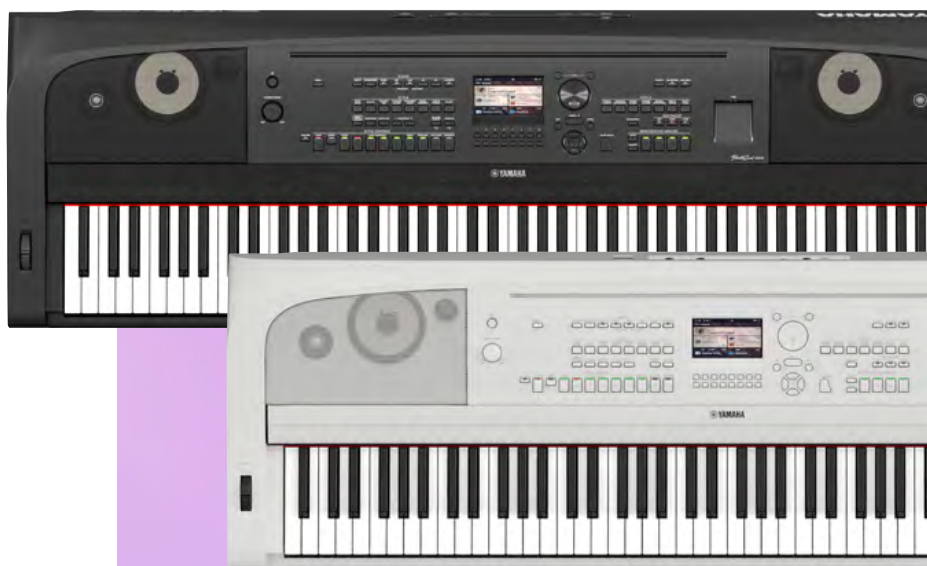
White DGX-670 available mid-year 2021

With Unison, you play a phrase while pressing the foot pedal, making the accompaniment Style play in unison with you. This lets you perform signature lines found in iconic songs or create your own signature licks for the whole band to follow. Accent lets you add rhythmic "shots" to accentuate notes of your choice simply by playing a little harder.